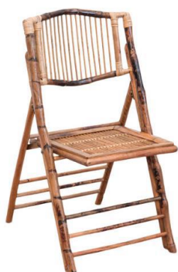
Bambú + 3€