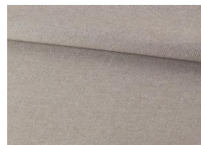
Stone colour linum tablecloth