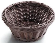
Rustic bread dish