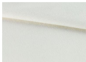
White linum tablecloth