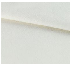
White linum tablecloth