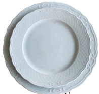
Coímbra or ocean bread dish