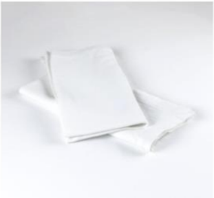
White linum napkins