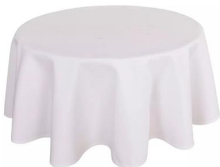
Round table (1,20m)