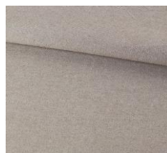
Stone colour linum tablecloth