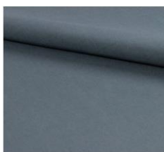
Anthracite Grey tablecloth